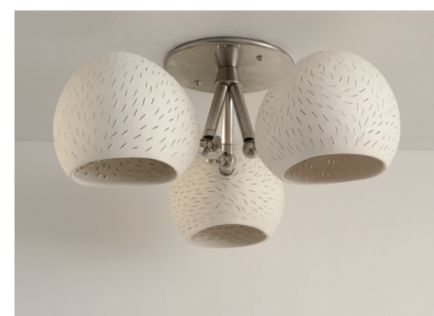
Day light image