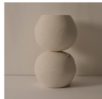
Day light image