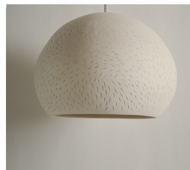
Day light image